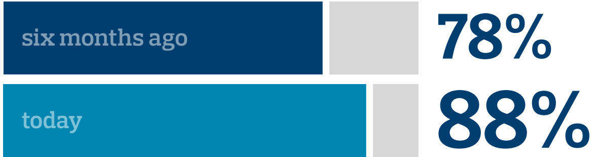
% of respondents who are implementing/improving DE&I initiatives

Improving DE&I, linking to specific metrics and ensuring accountability is a key focus for the workforce of the future.