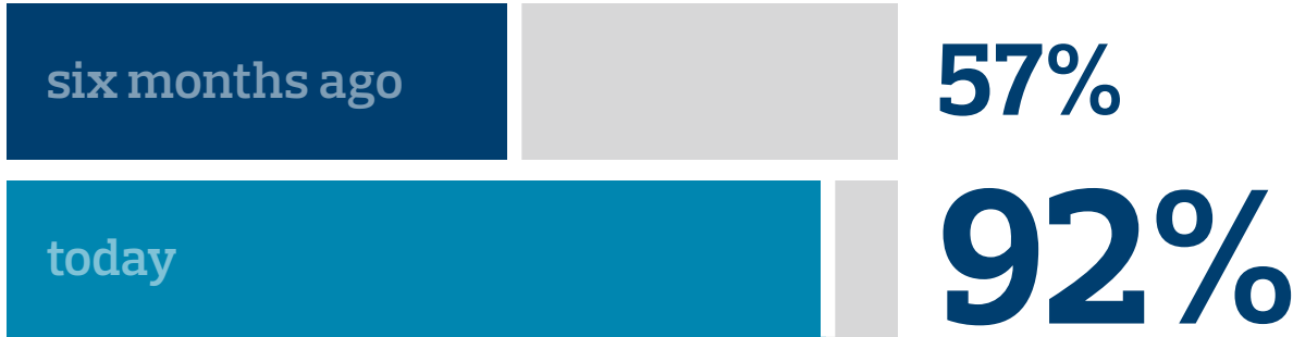
% of respondents who indicated attraction and retention is a current priority

Sourcing and retaining talent with future skills will secure a company's competitive advantage. Closing the future skills gap needs robust and fair selection and development programs.